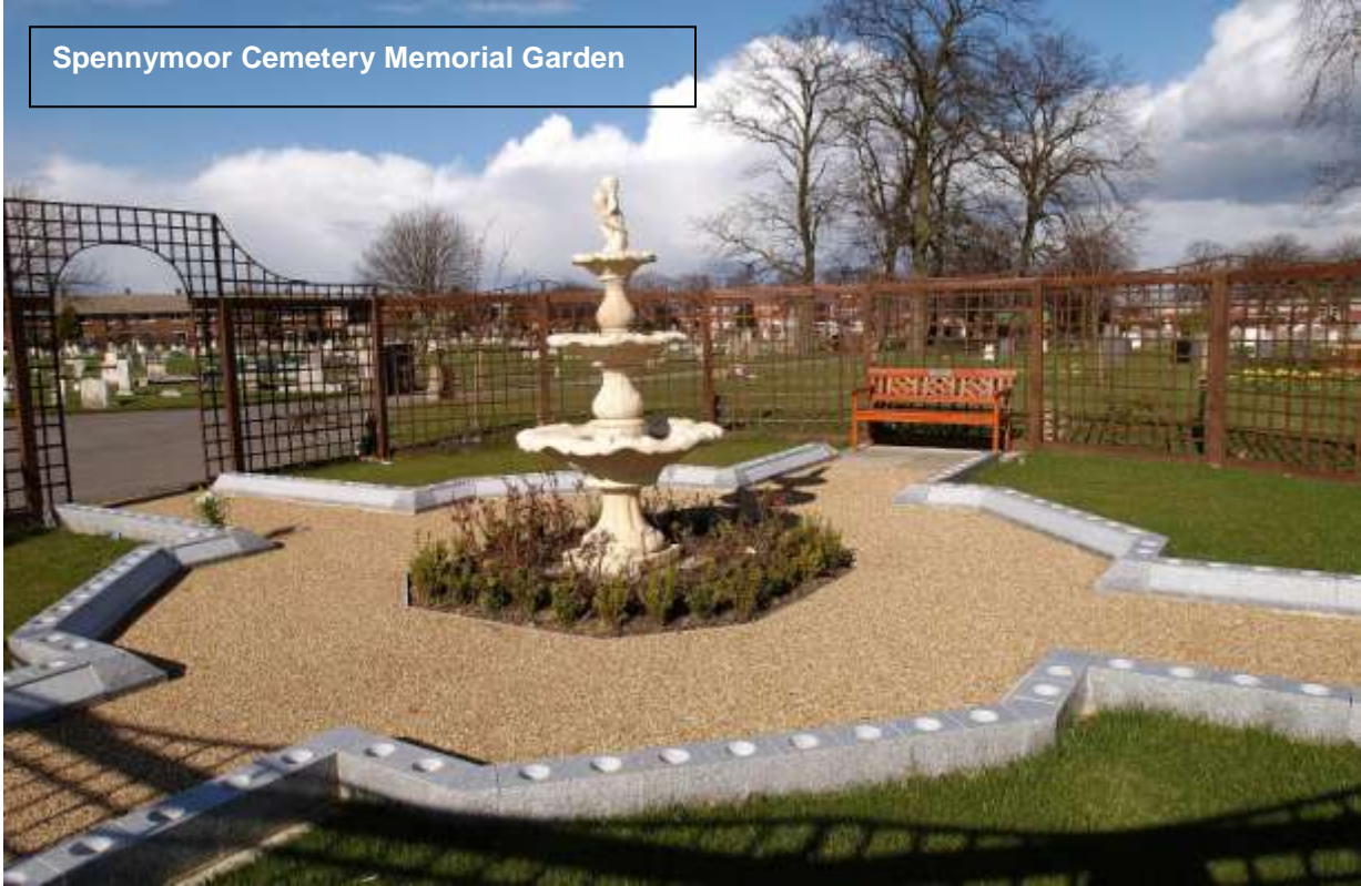
Spennymoor Cemetery Memorial Garden